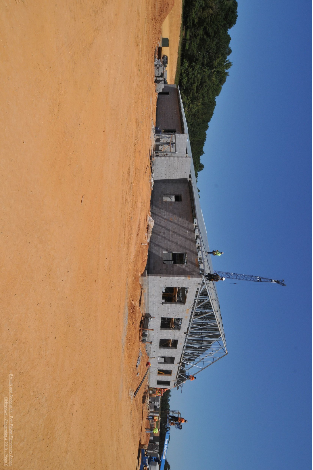
RA-LIN and Associates - Fort Payne Elementary School Slideshow - September 4 2019 - Photo 03